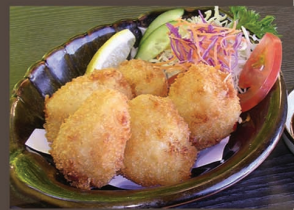
Oyster Katsu deep fried oysters coated in breadcrumbs $13.90