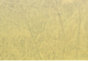
Edamame soy bean in pod with salt $ 5.90