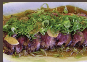
Beef Tataki $11.90