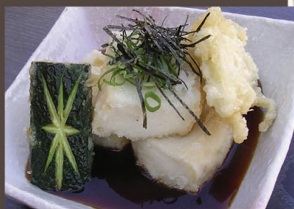
Agedashi Tofu $ 7.90