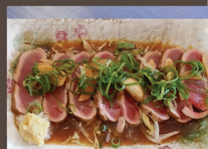
Wagyu Beef Tataki $17.90