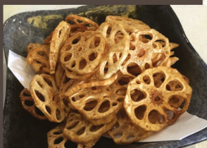
Lotus Root Chips deep fried lotus root with wasabi mayo $ 6.90