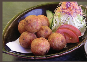
Scallop Katsu deep fried scallops coated in breadcrumbs $15.90