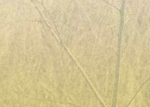
Tori Karage crispy deep fried chicken $ 10.90