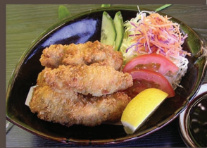
Prawn Katsu deep fried tiger prawns coated in breadcrumbs $13.90